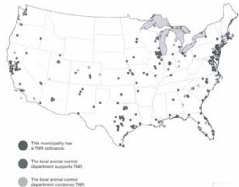
TNR ORDINANCES AND POLICIES ACROSS THE UNITED STATES